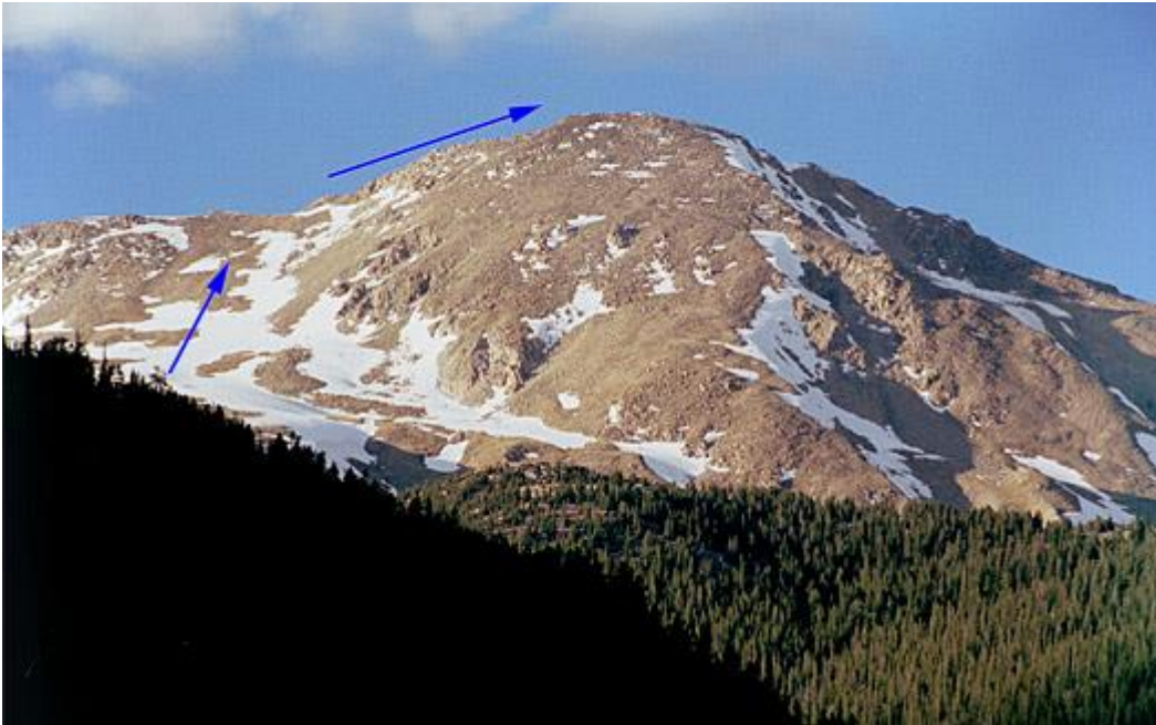
Upper portion of the route to Yale Mountain peak seen from County Road 306

Climbers: Brett Crandall and Amos; Rick Crandall and Emme