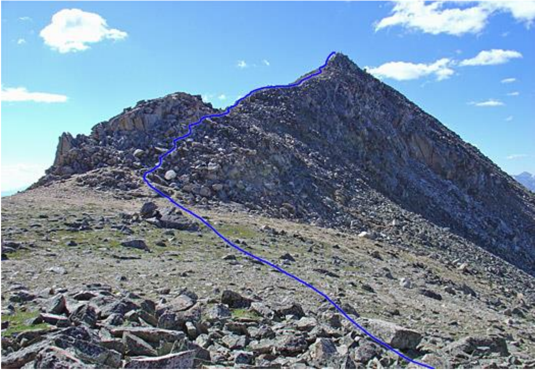
The summit ridge seen from 13,900' on the saddle. The summit is not yet visible. The last 1.5 miles to the summit is steep and slow going.