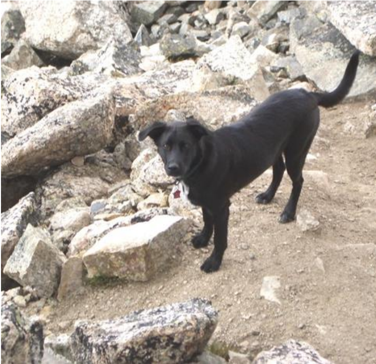
Amos is a hiker too!