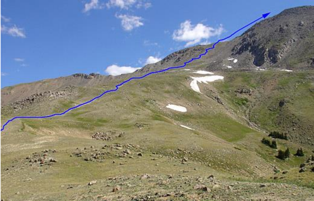
Near 12,100' about halfway up, viewing the remaining hike to the summit ridge.

From 11,300' to 11,900', we hiked northeast and then east through the forest. We left the trees at 12,000' and continued east as the trail approached a large shoulder. Once on the shoulder, the trail turned northeast toward Yale's upper west slopes. The remainder of the route was then visible.