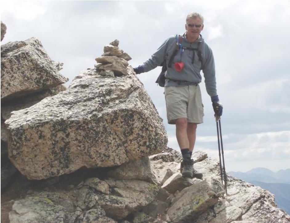
Passing a “cairn” – a pile of rocks used to show the way when no route is visible.