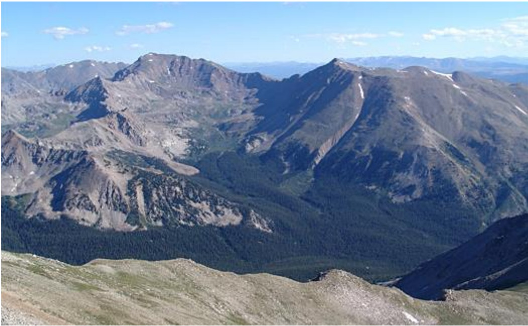
On the summit, looking north to Mt. Harvard and Mt. Columbia (right) also 14ers.